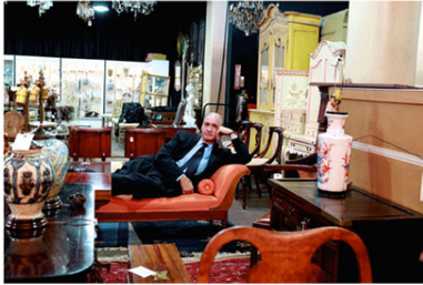
DESIGNING Where Sotheby's Scorns to Tread