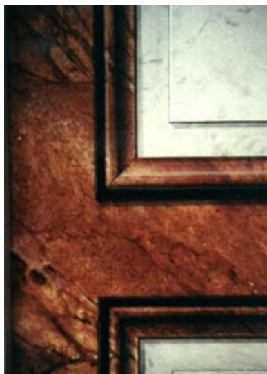
Faux marble on a flat door with faux moldings