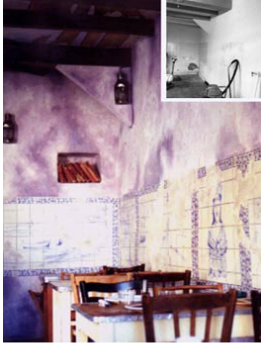
Created faux old cafe-bar with faux broken ceramics and decrepit patina on the walls.