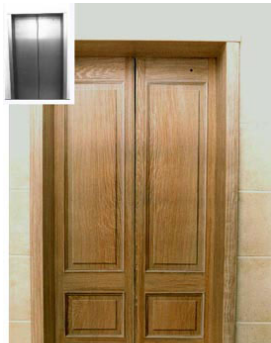
Faux wood and faux moldings on elevator doors