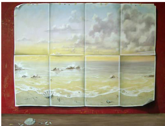
Many kinds of murals. Everything shown here is trompe l'oeil.