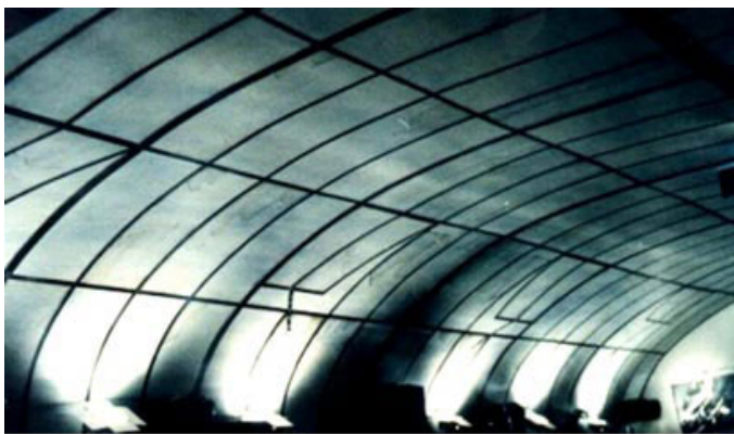
On an arched ceiling, faux sky scenery with a faux glass roof and faux broken, opened window panes.