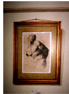
A copy of a master's drawing, all faux - Faux frame, faux string, faux nail, faux self stick tag