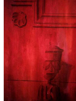
Provence patina with trompe l'oeil in ageing style