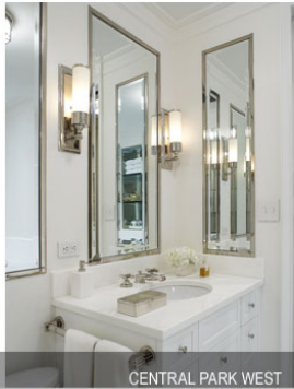
CENTRAL PARK WEST