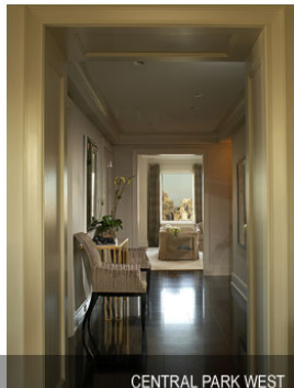
CENTRAL PARK WEST