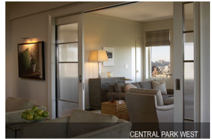
CENTRAL PARK WEST