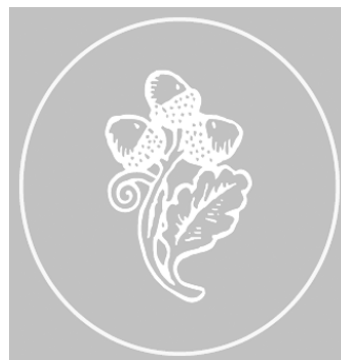
IF THIS IS YOUR COMPANY AND ARE INTERESTED IN ADDING AN IMAGE, PLEASE CLICK HERE