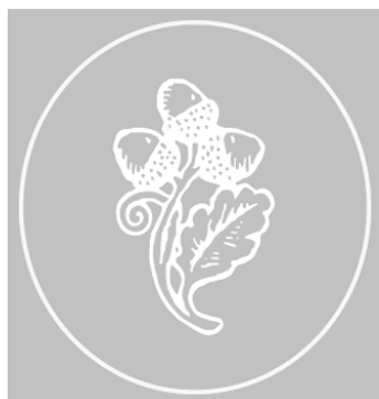
IF THIS IS YOUR COMPANY AND ARE INTERESTED IN ADDING AN IMAGE, PLEASE CLICK HERE